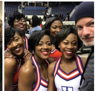
Students visited IBM, attended scores of networking events, hosted industry professionals, and represented the College at events like the Freedom Classic.