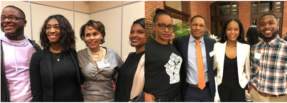
Students and alumna embrace.